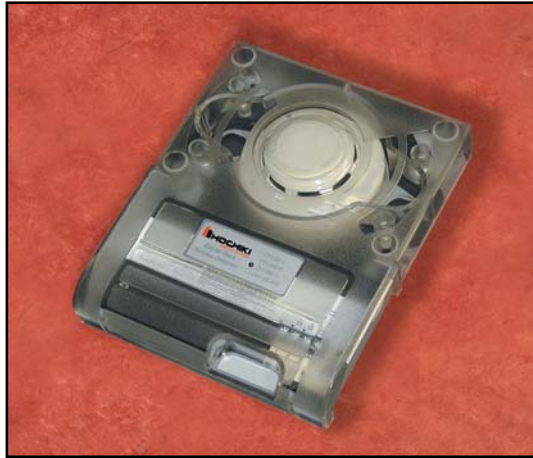
Duct housing with an ALG-DH analog photoelectric sensor.