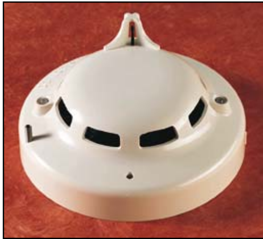
Shown without base.